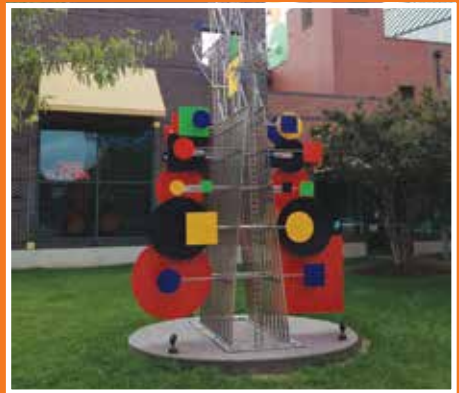
Standing Vase with Five Flowers by James Surls graced the median along Green Valley Road.